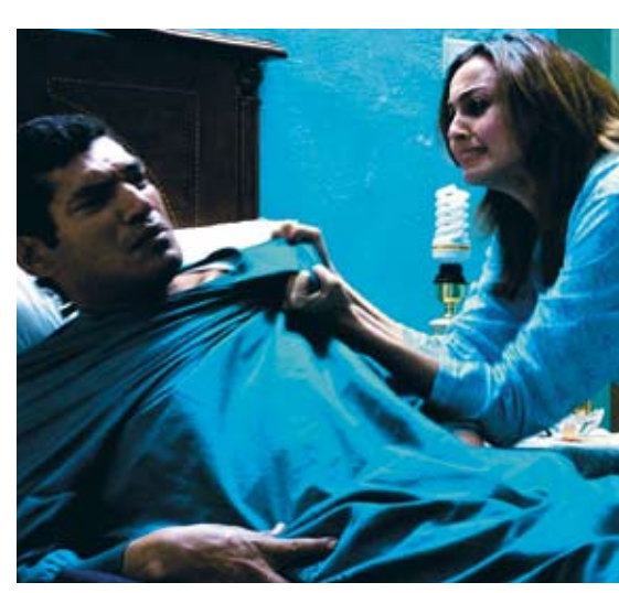
Six, Seven, Eight is a story of three women