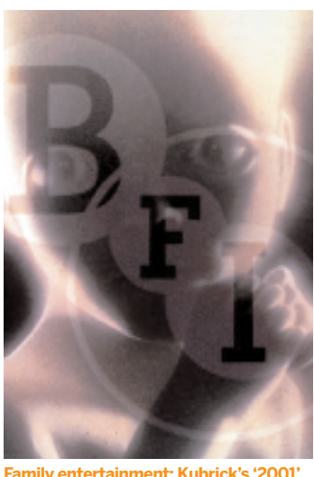
amily entertainment: Kubrick's '2001'

In eight short chapters Krämer discusses and analyses the film's origins its development, production, release reception and influence, and generally acquits himself well in providing an introductory study. Chapter six contains the best narrative description of 2001 I've ever read. Krämer is also revealing about the film's initial critical reception. showing that it was generally acclaimed rather than panned (as folk memory has it) and that it didn't just appeal to acid heads but had a wide family audience.